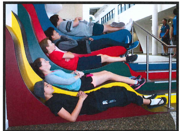
Year 9 Camp photos